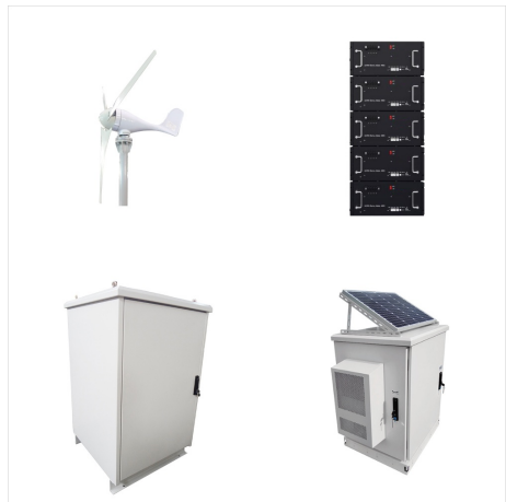
photo-voltaic power plant

The Sephu Solar Project will be Bhutan's first mega solar power plant and once it is completed, the plant is expected to generate 26.15 million units of energy earning an annual revenue of Nu 132.29 million. The ???