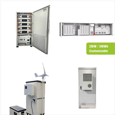
Hynfra Energy StorageOX2130MWh ? 1/4 ? ? 1/4 ? ? 1/4 ?2023-01-10 ? 1/4 ? ? 1/4 ? ,Hynfra Energy StorageOX2,130MWh